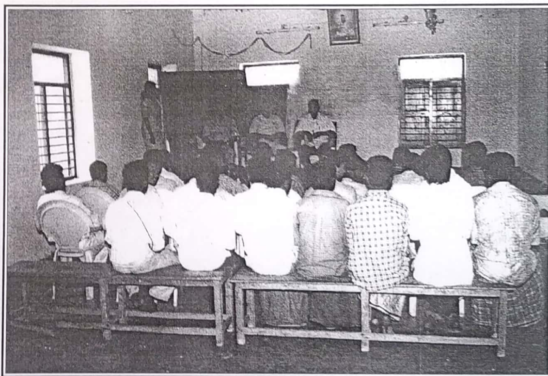
YOUTH GROUP SHG MEETING THIRUKOILUR BLOCK 2006 - 2007