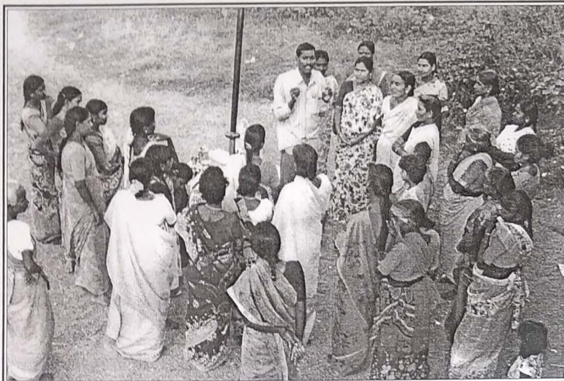
ATSSS SHG GROUP MEETING A GLANCE 2006 - 2007